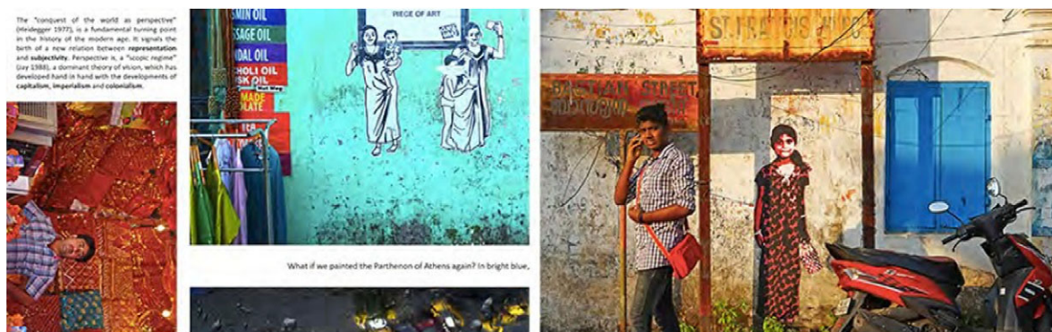
FIGURE 2. Close-up segment of the visual essay. [Color figure can be viewed at wileyonlinelibrary.com ]

definition photographs of “tainted public spaces” taken by the author in India (Delhi, Kochi, Mumbai, and Kolkata) and Cuba (Santiago de Cuba and Havana), “Tainted Frictions” addresses color as a terrain of confrontation and friction between the colonized and the colonizer. Refusing to reproduce the simple dualisms of chromophobia versus chromophilia and of West versus the rest , the essay nevertheless challenges the “unstable mix of attraction and repulsion” that characterizes Western relations to color in general and vivid color in particular (Taussig 2006, 31). Dominated by ideas about rationality, mathematics, geometry, and lines (see Crary 1990; McQuire 1998), the West has looked upon color as secondary to form. Diverging from the white, heterosexual, civilized (bourgeois), male norm , color became associated with women, children, and primitive people. Goethe famously wrote, “savage na-