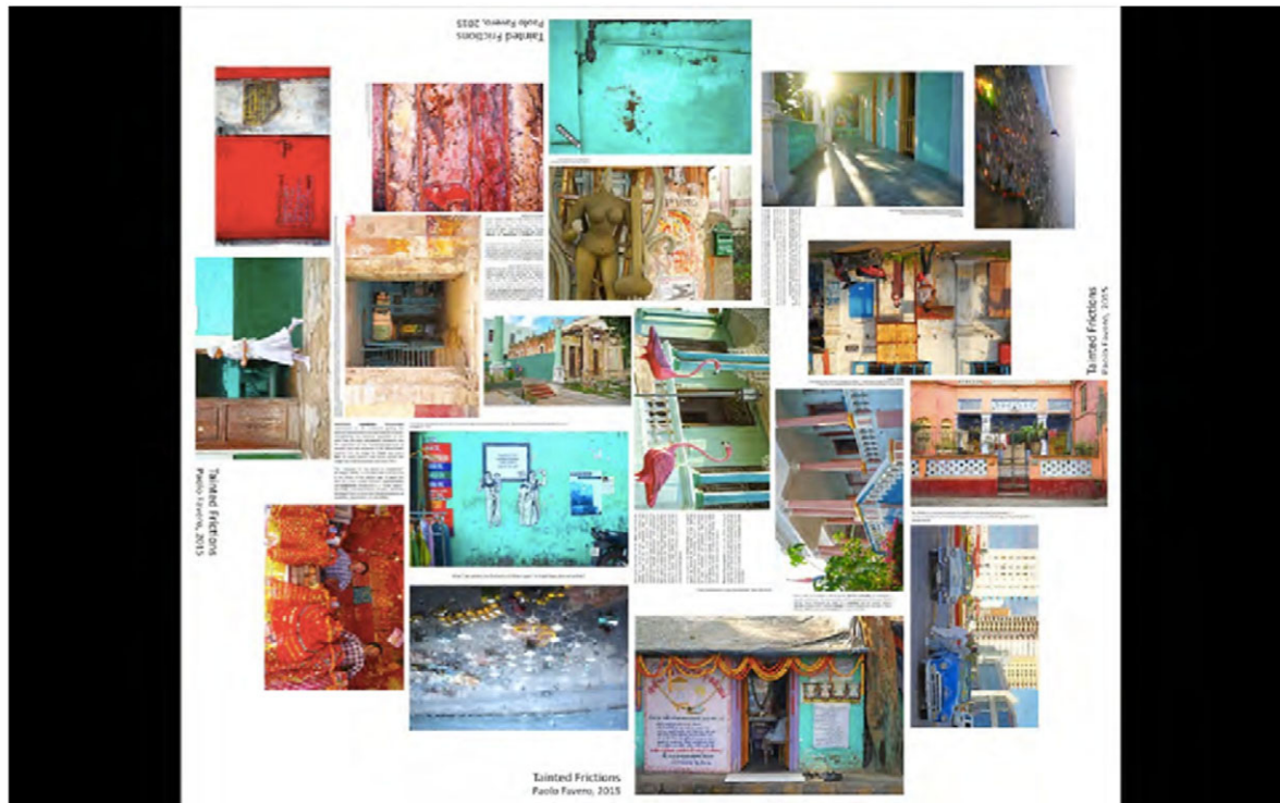
FIGURE 1. The entire visual essay. [Color figure can be viewed at wileyonlinelibrary.com ]